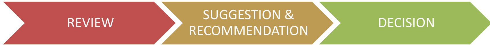
CHART OF REMUNERATION PROCESSES: Member of the Board of Commissioners, Sharia Supervisory Board and the Board of Directors

1. The Committee performs a survey to obtain benchmark data of remuneration of the Board of Commissioners and the Board of Directors in several banks in Indonesia. Where necessary, the Committee may appoint / cooperate with Consultant / Independent Party to obtain more valid data. 2. The Committee reviews the survey result / benchmark data that have been obtained.