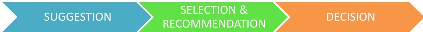
CHART OF NOMINATION PROCESS: Independent Party of the Audit Committee and Risk Monitoring Committee